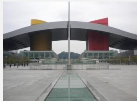
Shenzhen Municipal People's Government Building

You could spend a few days in Shenzhen as part of a Hong Kong holiday. Alternatively you could easily spend a week or more experiencing all that the central Shenzhen area districts of Futian, Luohu and Nanshan have to offer. If you want to travel further afield to experience the attractions of the other Shenzhen districts then at least two weeks is suggested.