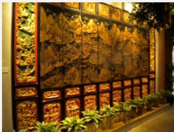
Golden varnished woodcarving, Shenzhen Museum of History

Lotus Hill (Linhuashan), shaped like a lotus flower and located in Futian District, offers good views over Shenzhen and features family recreational facilities such as a kite flying lawn and a fishing lake.