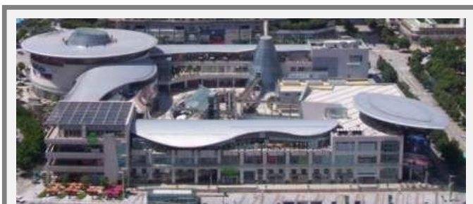
Coco Park shopping centre, located in Futian District, includes a Jusco store and Shenzhen Metro station

There are also traditional shopping areas such as Dongmen Old Street, which includes historic buildings from Shenzhen's past and is one of the city's busiest shopping areas, and Hua Qiang Bei Road.