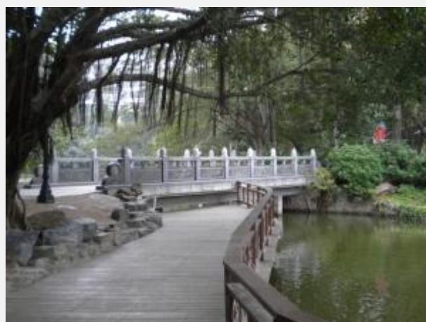
Lychee Park in Luohu District, one of Shenzhen's many beautiful parks

These beautiful beaches are located on Dapeng Bay in Yantian District, about 30km east of the central Shenzhen area. The larger Dameisha beach is a public area, whereas there is an entrance fee for Xiaomeisha beach. Xiaomeisha also features Shenzhen Sea World, a marine life aquarium with displays and shows, and the OCT East resort is located in Xiaomeisha's mountain hinterland.